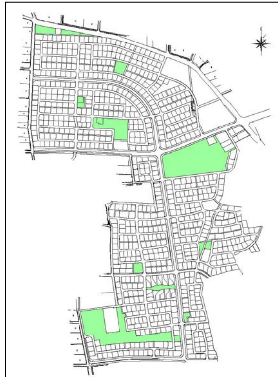
Location of Ota city and site map of the demonstration area (Jyosai town)

In 2002, NEDO (New Energy and Industry Technology Development Organization) initiated a new R&D program for PV grid interconnection. The objective of this program is to demonstrate that a power system of several hundred residences, where each residence has a PV system, can be controlled by the technologies developed in this program without any technical problems.