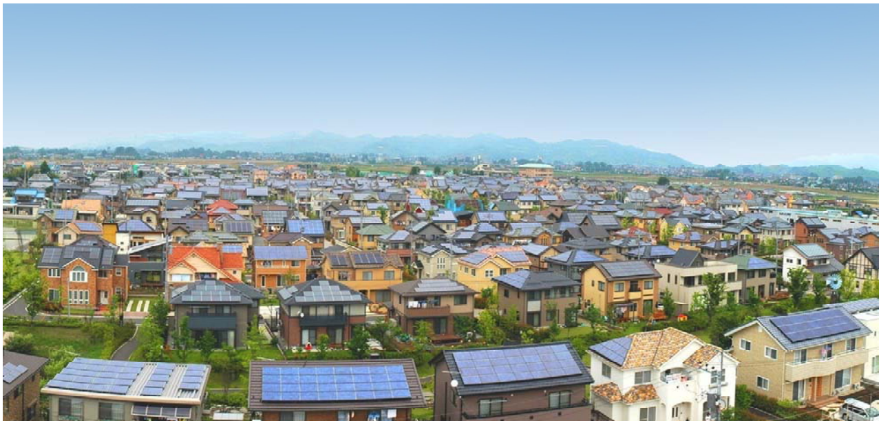
Overview of the demonstration site

The development project of the demonstration-site, Jyosai town, was originally planned as a normal housing area development. In order to shift the concept of the project to the solar development and align with the needs for the research on PV grid connection, the local government was also included in the project team. In addition, the concept of this project had been explained to the potential owners of the houses. The development plan was modified so that it matched with the research project.