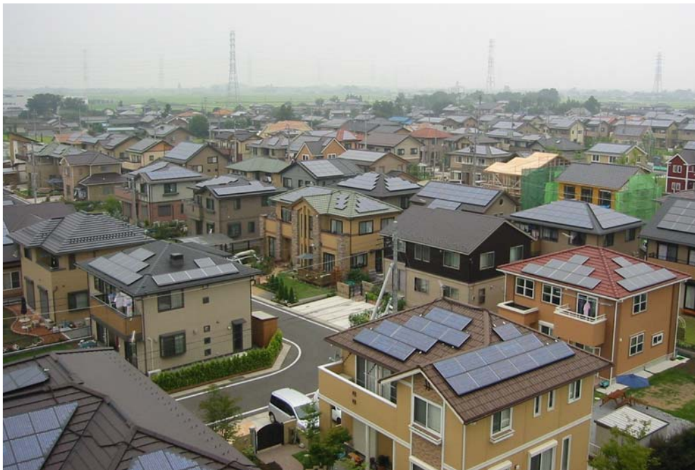
Overview of the demonstration site

It should be noted that this project was aimed at research and the costs were paid from the research budget, therefore, it might be quite different from a general development project. In addition the organization, structure, and mindset of the utility companies in Japan are quite different from that in Europe or the US. In Japan, it is very important to understand the utility's intention through prior consultation.