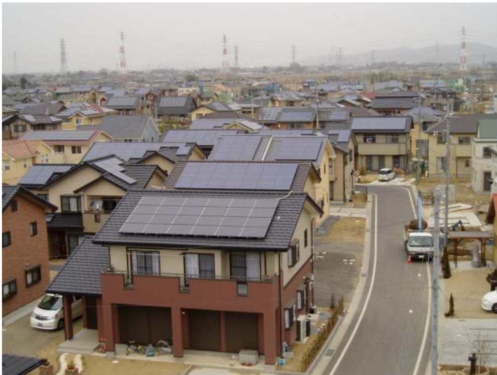
Overview of the demonstration site

Although most of the questions raised by the utility company are solved through those measures, there are still some technical questions remaining for the second issue and research is being conducted to overcome this issue.